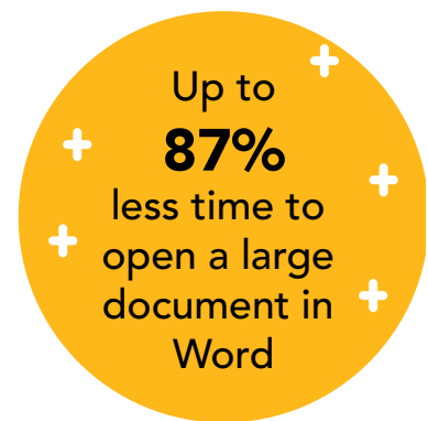
Figure 1: The time each device needed to open a 92MB Microsoft Word document while multitasking (in seconds). Lower is better.