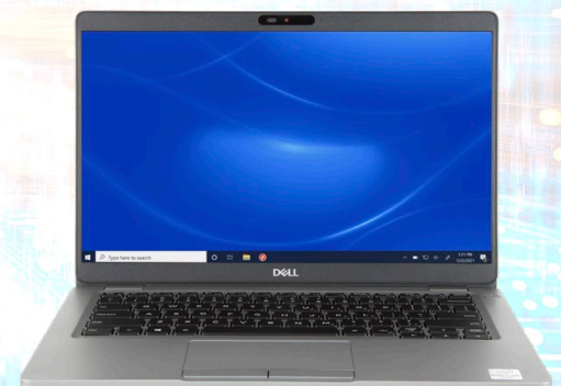
Intel Core i7-10610U processor-powered Dell Latitude 5310 with Intel vPro technology

In addition, the Intel Core i7 processor-powered laptop could allow you to run VMs simultaneously. Supporting multiple environments at once could benefit freelancers and other users who need to run multiple corporate images for different clients or applications.