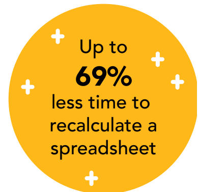
Figure 2: The time each environment needed to recalculate a formula in a 94MB Microsoft Excel spreadsheet while multitasking (in seconds). Lower is better.