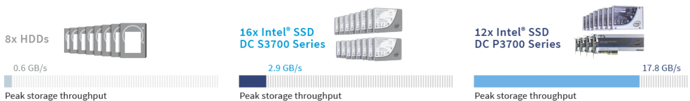
Figure 2: The peak disk throughput in GB per second for each solution. Larger numbers are better.